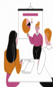
Minutes of the Meeting